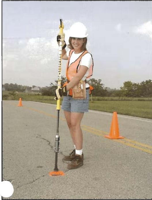
The thunderbolt is designed to dig up survey markers in the pavement faster, easier and safer.

P.O. Box 516 Ross, OH 45061 1-800-262-4992 Fax 513-738-5817 www.chrisnik.com